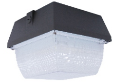
LED GARAGE LIGHTER