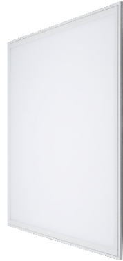
LED PANEL LIGHT