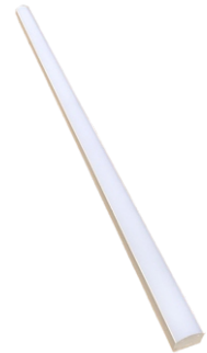
LED LIGHTING BOLT