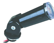
FD PHOTOELECTRIC SWITCH